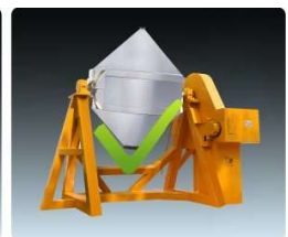
Double cone blender Volume up to 36000L 70% loading rate