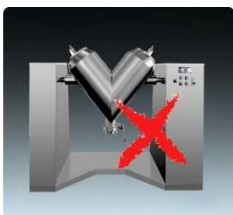
V type mixer Small volume 45% low loading rate