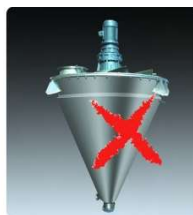
Single cone mixer Volum < 5000L 60% loading rate