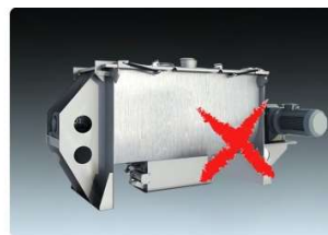
Ribbon mixer Bad mixing uniformity 60% loading rate