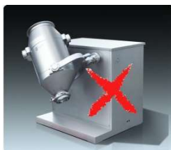
3-Dimensional blender Small volume 40% low loading rate